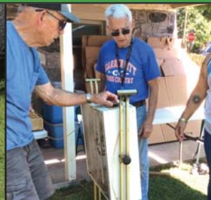
Will the fan work?