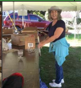
Starting to pack up