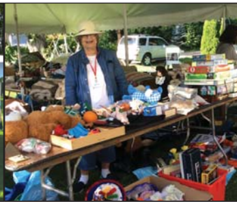
Starting to sell