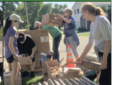
More packing up!