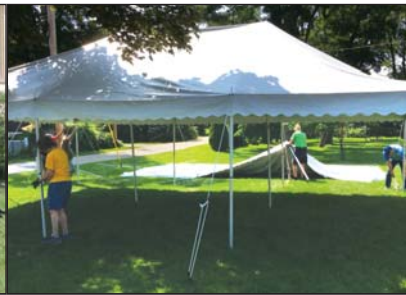
Large tent setup