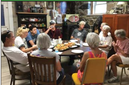
Volunteer lunch break